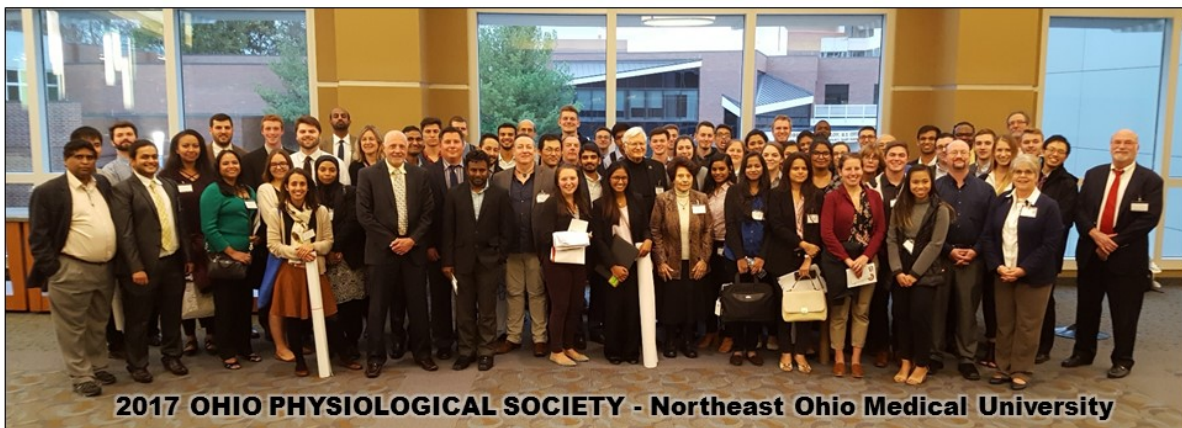
2017 OHIO PHYSIOLOGICAL SOCIETY - Northeast Ohio Medical University